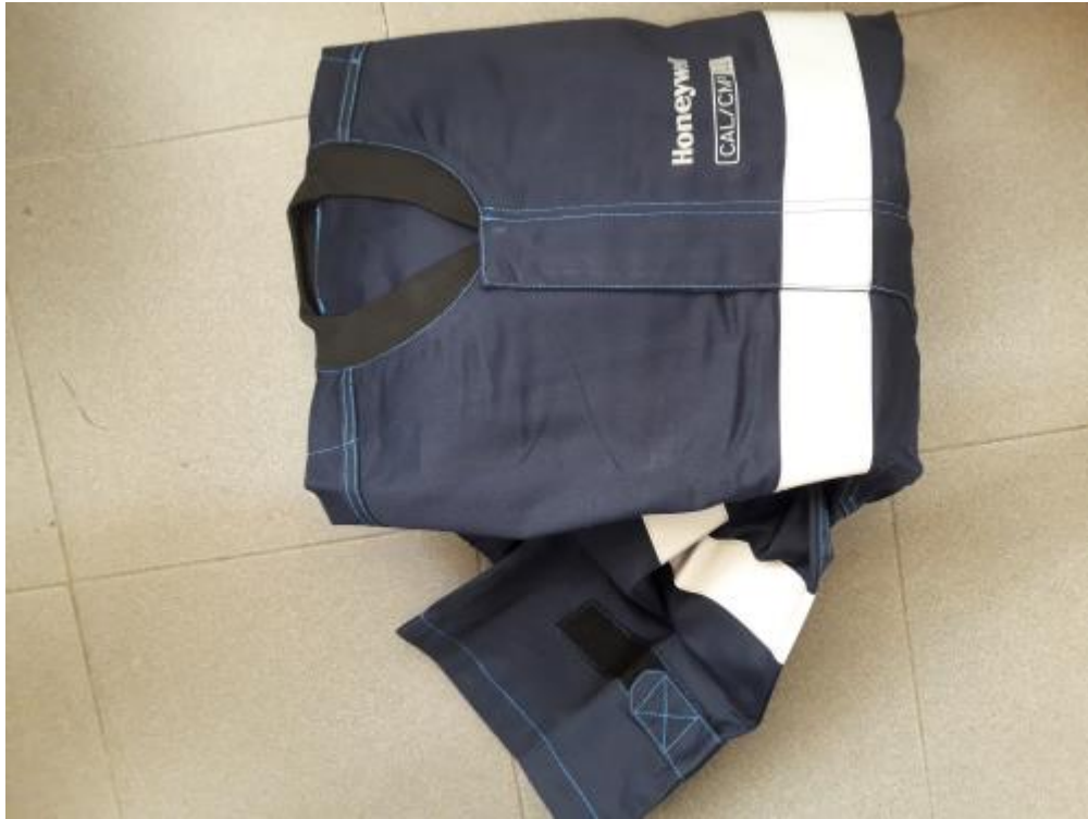
Reference (1) Coverall INACCA12RB